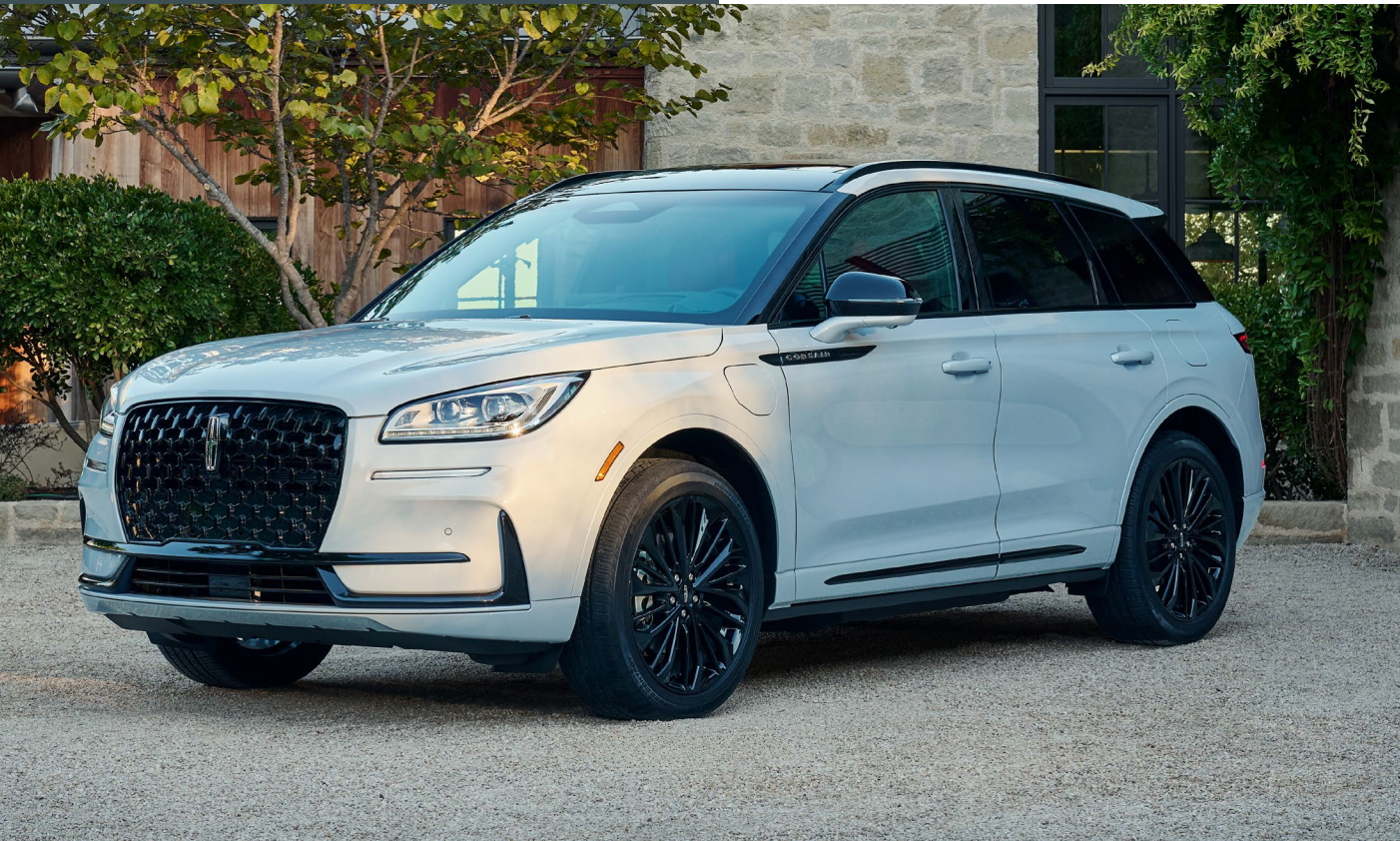
2026 Lincoln Corsair Grand Touring with available Jet Appearance Package in extra-cost colour option Crystal White Metallic Clearcoat.