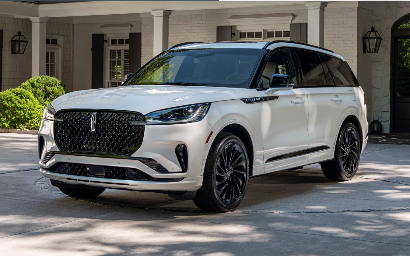
2026 Lincoln Aviator Reserve with the available Jet Appearance Package in extra-cost colour option Pristine White Metallic Tri-Coat.