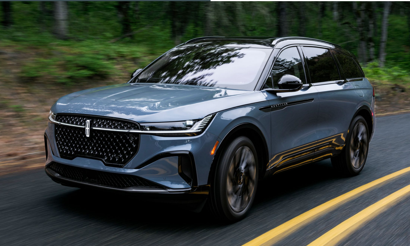
2026 Lincoln Nautilus Reserve shown with available Jet Appearance Package in extra-cost colour option in Whisper Blue Metallic Tinted Clearcoat.