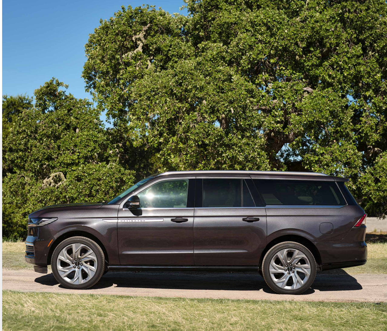
2025 Lincoln Navigator L Reserve shown in extra-cost colour option Starlight Grey.

The Society of Automotive Engineers (SAE) testing standard J2807 ® defines procedures and requirements to determine gross combined weight ratings (GCWR) and to calculate the trailer weight rating (TWR) for any tow vehicle. This standard establishes minimum performance conditions to allow for consistent comparisons between similar class vehicles.