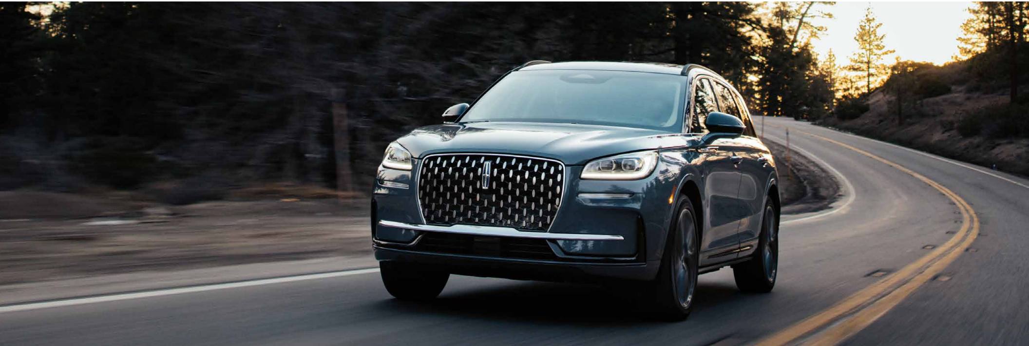
2025 Lincoln Corsair Grand Touring shown in extra-cost colour option Whisper Blue Metallic Clearcoat.