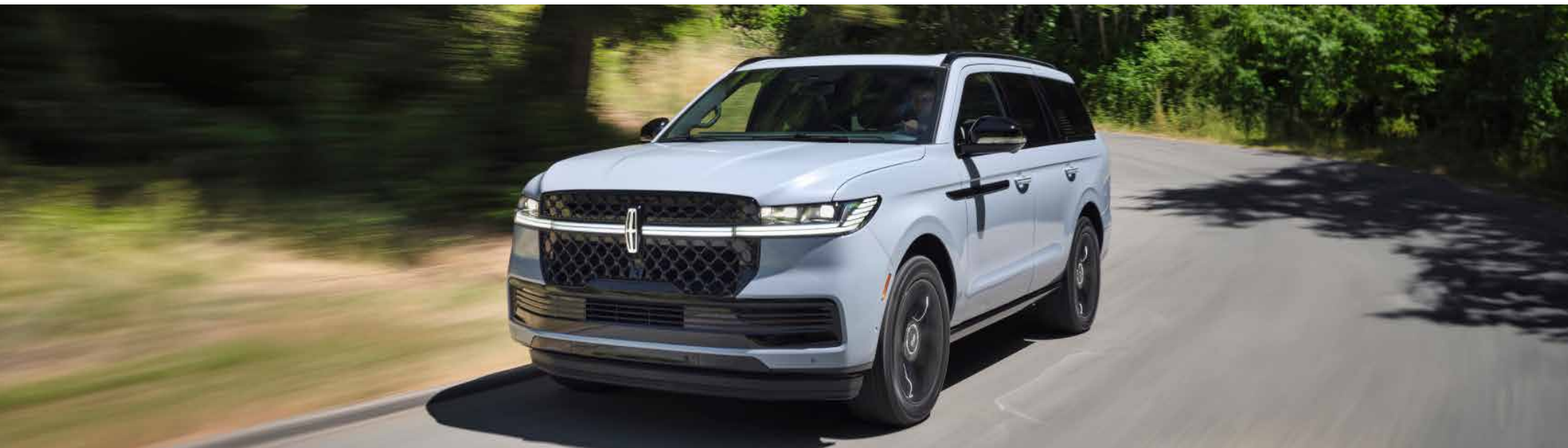
2025 Lincoln Navigator Reserve with Jet Appearance Package shown in extra-cost colour option Grey Mist.