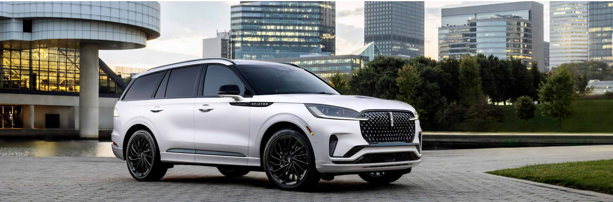
2025 Lincoln Aviator Reserve with Jet Appearance Package shown in extra-cost colour option Pristine White Metallic Tri-Coat.