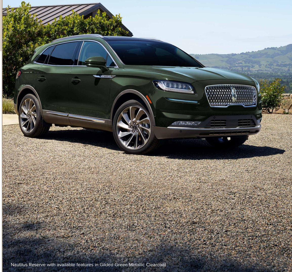
Nautilus Reserve with available features in Gilded Green Metallic Clearcoat

M Metric Conversion – To obtain information in kilograms, multiply pounds by .45; to obtain information in square metres, multiply square feet by .09.