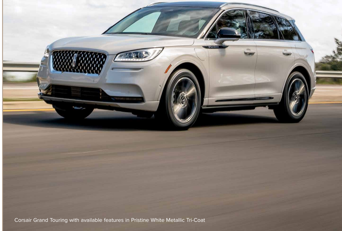
Corsair Grand Touring with available features in Pristine White Metallic Tri-Coat

M Metric Conversion – To obtain information in kilograms, multiply pounds by .45; to obtain information in square metres, multiply square feet by .09.