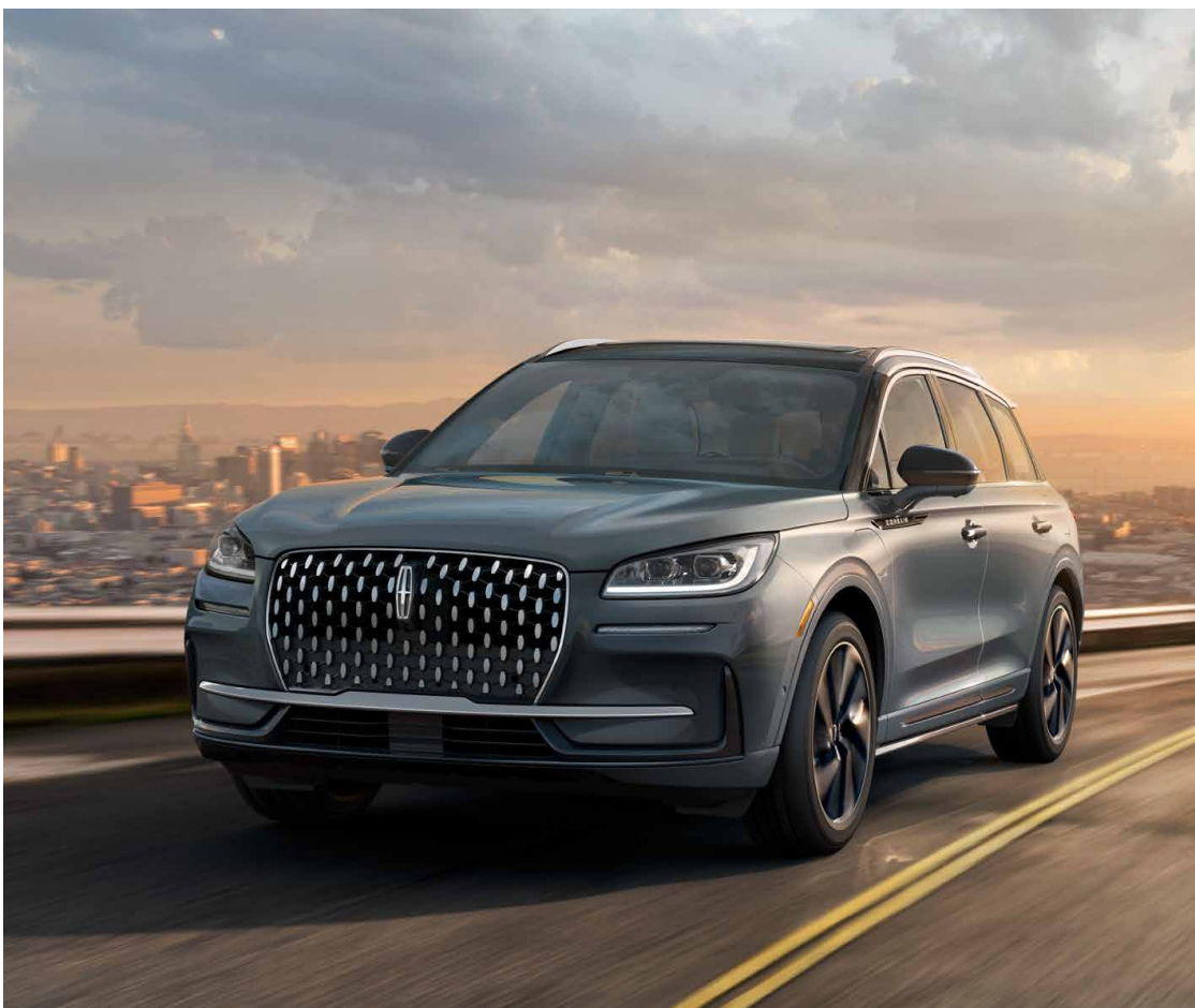
Corsair Grand Touring with available features in Whisper Blue Metallic Clearcoat*