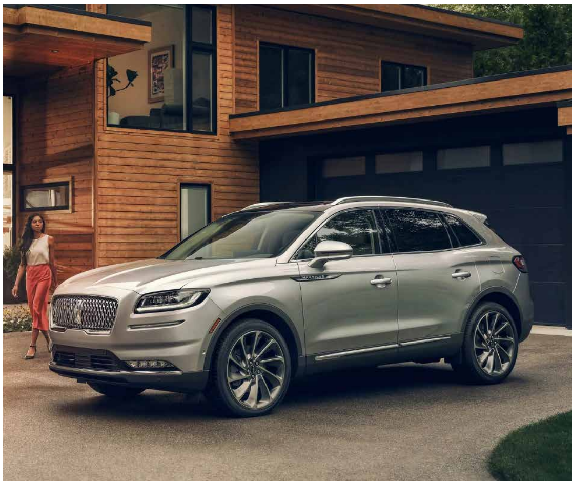
Nautilus Reserve shown with available features in Silver Radiance Metallic Clearcoat

Some models, trims and features may not be available or may be subject to change.